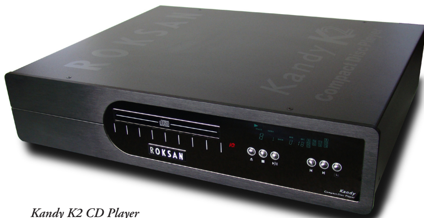
Kandy K2 CD Player

Visit us in the Syndicate 5 Room @ The Audio & AV Show 2008 Park Inn London Heathrow Bath Road, London Middlesex UB7 0DU