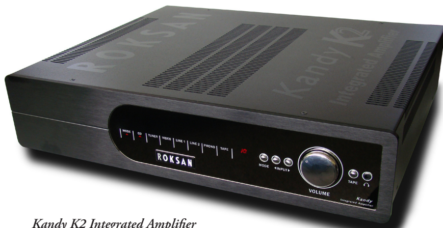
Kandy K2 Integrated Amplifier